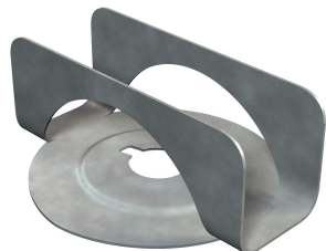
Locknut for CPC ceiling profile clamp